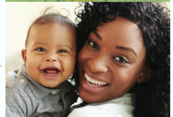
SALES COORDINATOR (SC)