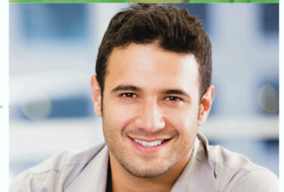
VIRTUAL FRANCHISEE (VF)