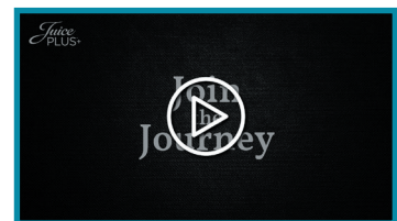
Join the Journey http://player.vimeo.com/video/531990703