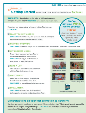
Partner+ Getting Started Checklist http://bit.ly/Getting_Started_1