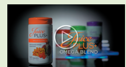
Juice Plus+ Omega Blend