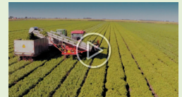
How Juice Plus+ is Made