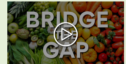
Bridge the Gap